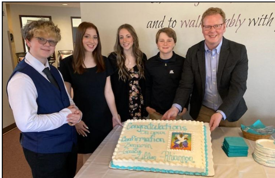
Celebrating with cake after worship!